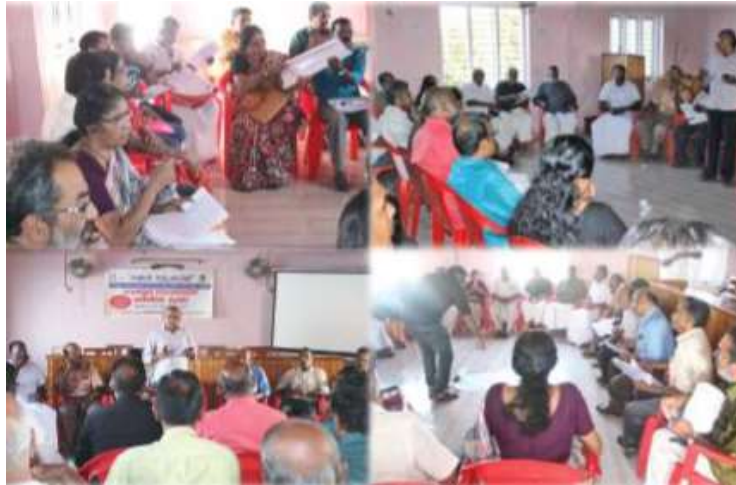
Fig: Various consultation meetings at ward levels

pregnant women, houses with women as earning members, care home inmates, migrant workers and elderly persons living alone etc.