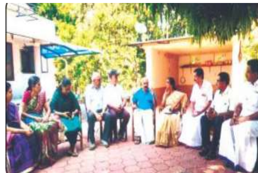
Fig: Situation analysis and focus group meetings across various LSGIs

The DM plan also records the history of disasters in each ward of the LSGIs with details such as human casualties, damaged houses, damaged infrastructure, agriculture loss, and loss of livelihood. The DM plan also gives special emphasis on groups that need special attention during disasters, for instance, persons with disabilities, children below six years, people under palliative care, elderly,