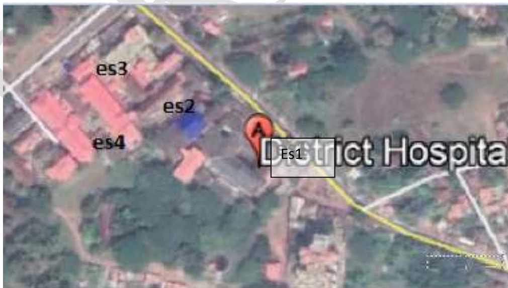
Illustration 2 – Map of evacuation sites (ES) – Should get satellite image