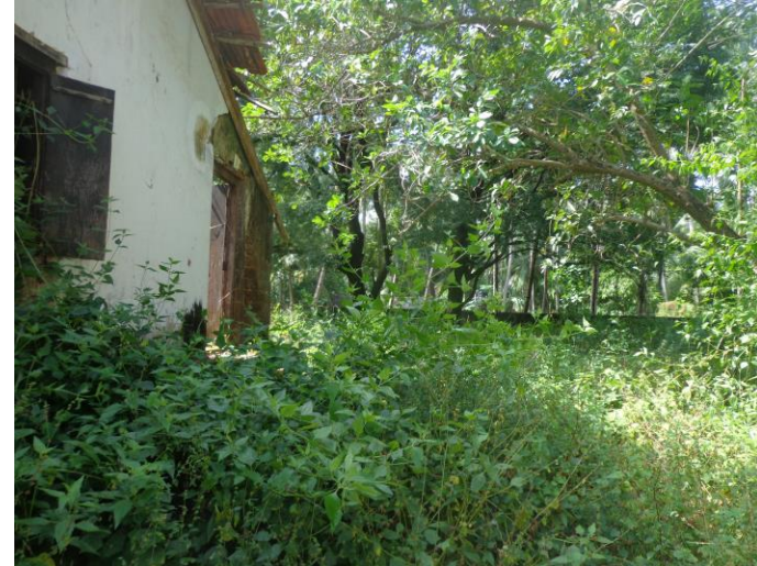
2. View of the site at Kadappuram