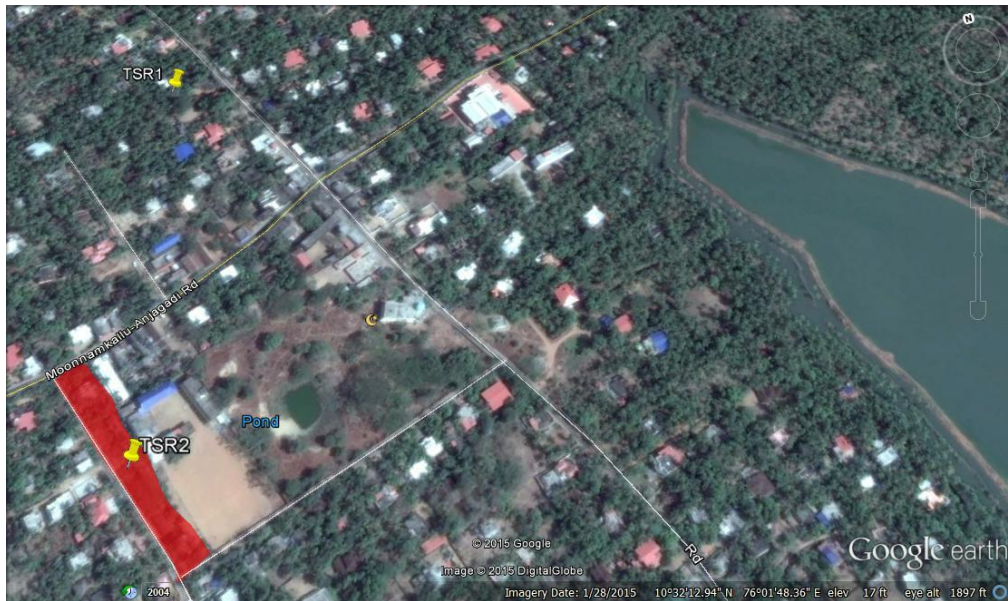
Aerial view of site