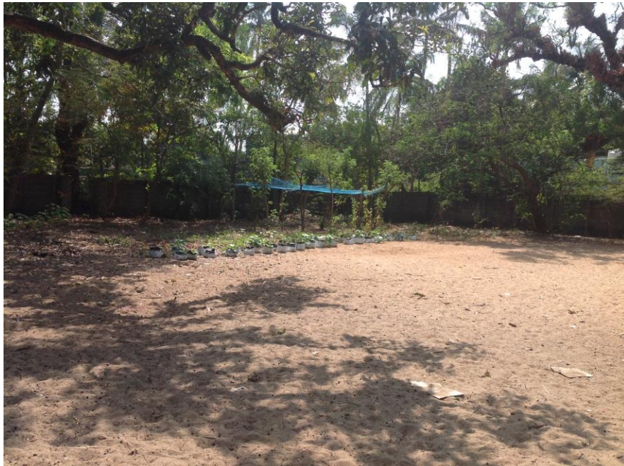
View of site at Vadanappally