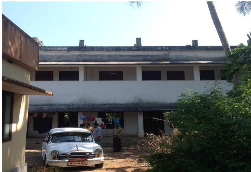
View of site at Kadappuram