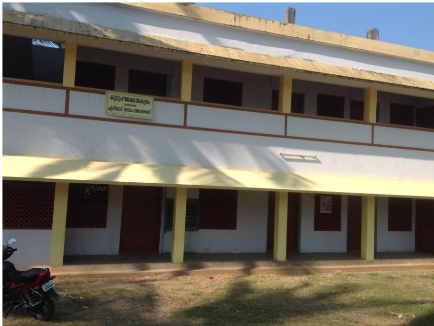
Building existing in the site