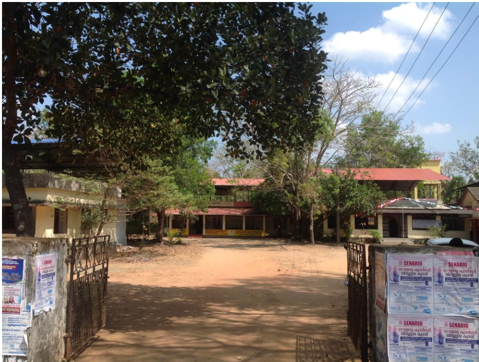
View of site at Edakkazhiyoor