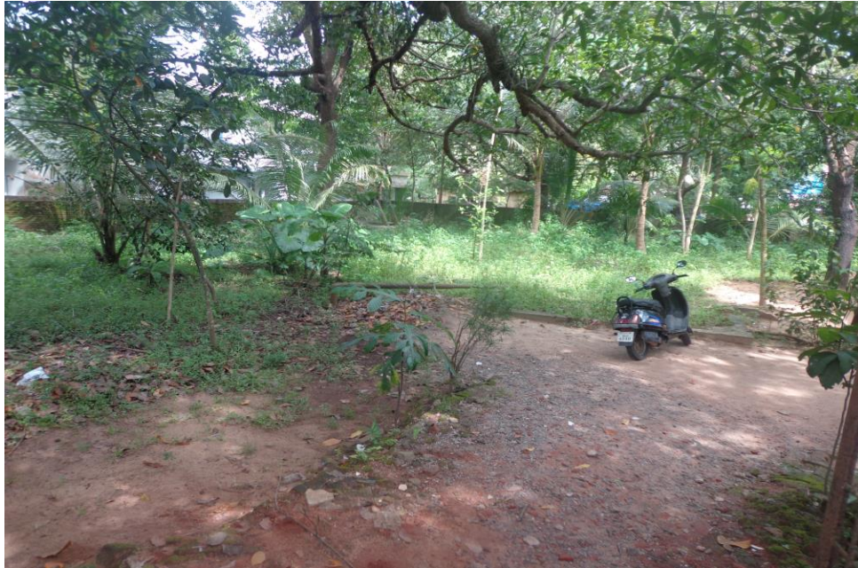
1. View of site at Azhikode 2. View of approach road from the site