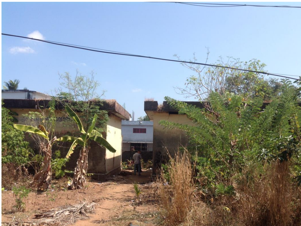
View of the site