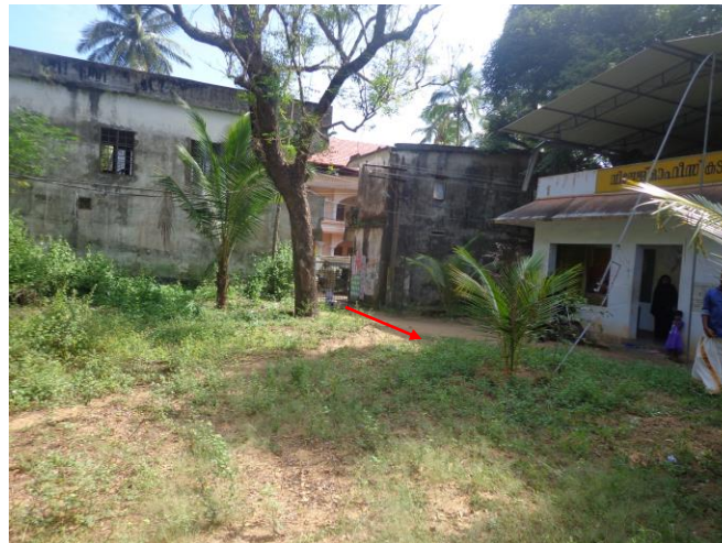
3. Entry to the site