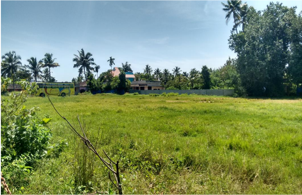
1 and 2: View of the site