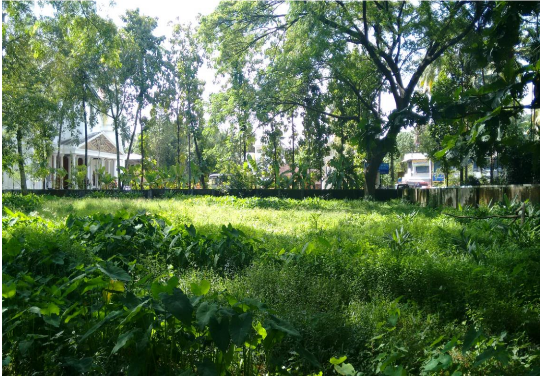
1. View of site at Moothakunnam 2. View of school premises