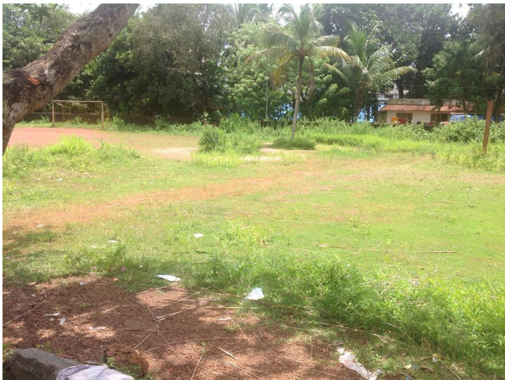
1 and 2: View of the site