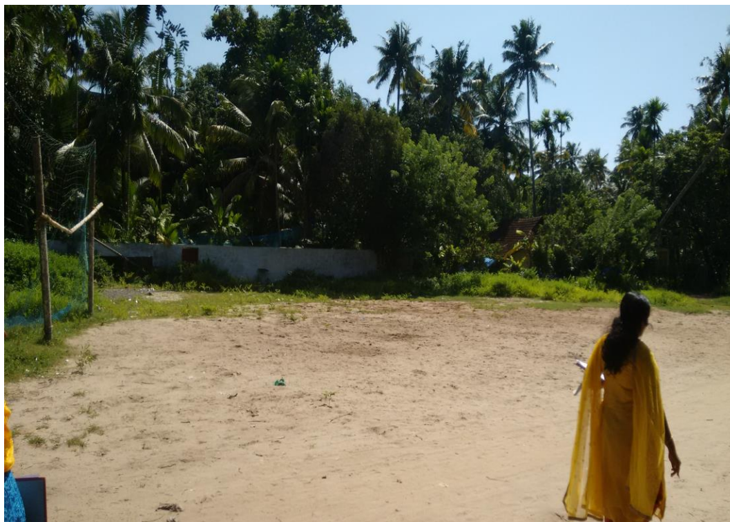
1. View of the site at pallipuram 2. View of the pond near to the site