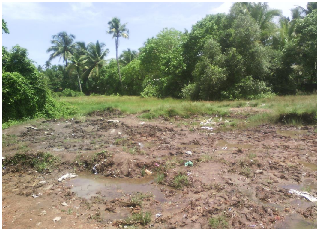
1. View of the site at Kumbalangi 2. View of approach road to the site