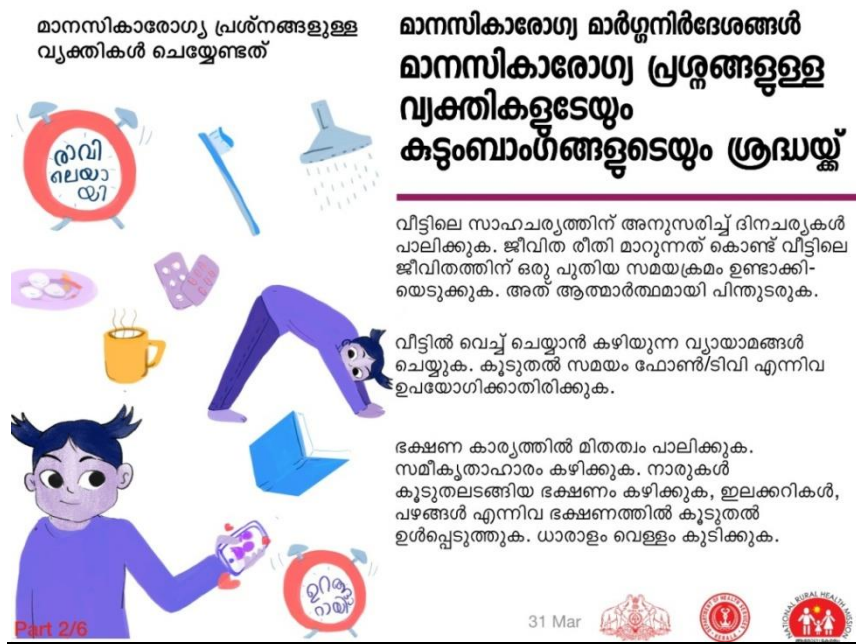
Poster with instructions for lockdown phase aimed at those with Mental Health issues