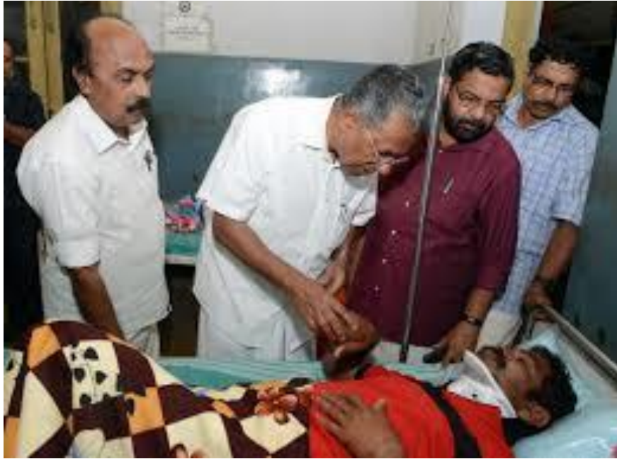
Kerala Chief Minister Shri. Pinarayi Vijayan provides psychological support to victim of Ockhi Cyclone

Psychosocial Interventions started on 2 nd December, 2017. Mental Health Disaster Management team was constituted under District Mental Health Programme (DMHP), Thiruvananthapuram, comprising of School Counselors of ICDS, School Health Nurses of RBSK (NHM) & DISHA Counselors