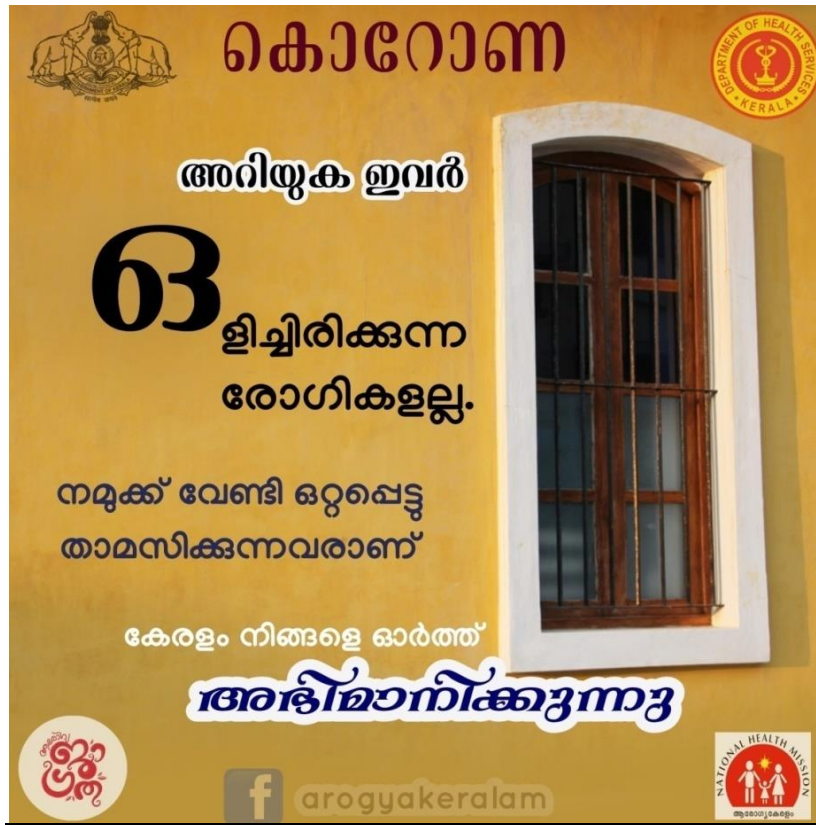
Poster intended at providing psychosocial support to those under home isolation