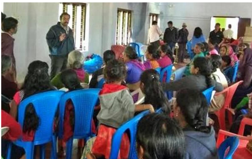
A group counselling session in a relief camp during Kerala Floods 2018