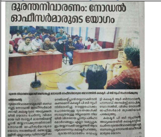
Figure 16 Media coverage in Pathanamthitta