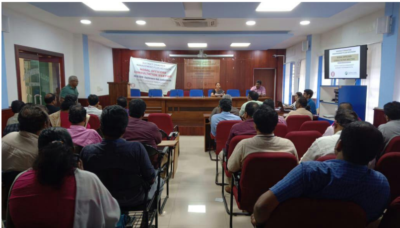
Figure 2 Participants in Nodal Officer consultation