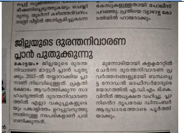
Figure 15 Print media coverage in Kottayam district