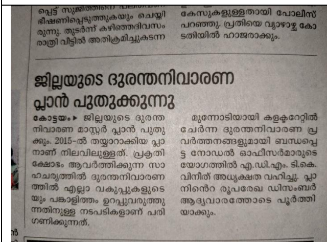
Figure 18 Media coverage in Kottayam