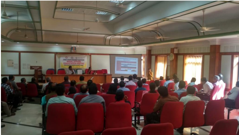
Figure 12 Ms. Abija Jagadeesh delivering session

District level nodal officer consultation meeting was organised at collecterate conference hall on