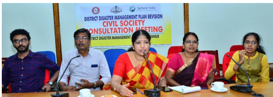
Figure 14 Cicial society consultation

District level civil society consultation meeting was organised at collecterate conference hall on 02 November 2019. 35 representatives of nodal civil society organisations participated District