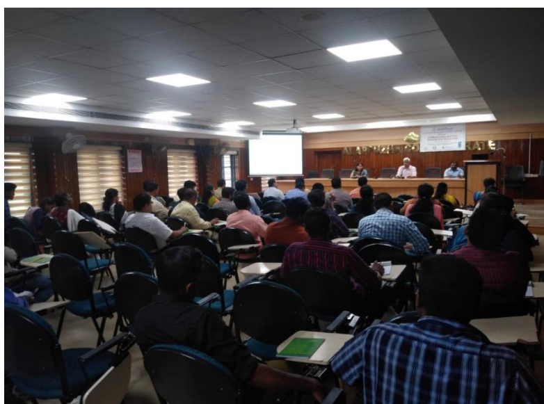
Figure 4 Participants during the session

District level civil society consultation meeting was organised at collecterate conference hall on 15 October 2019. 19 representatives representing various civil society organisation.