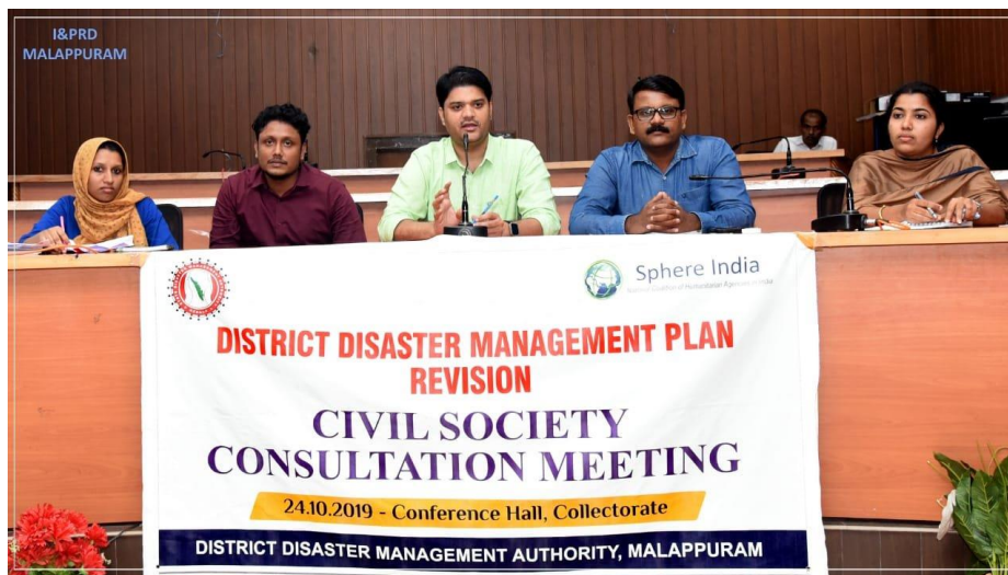
Figure 10 District collector addressing participants at the meeting

The first level consultation meeting of Civil Society organisations of Malappuram district for DDMP revision was held on 29 October 2019 at conference hall, District Collectorate, Malappuram. The meeting was prolific with a participation of about 73 participants who representing 53 various civil society organisations. All the participants cherished the efforts of District administration and DDMA and Sphere