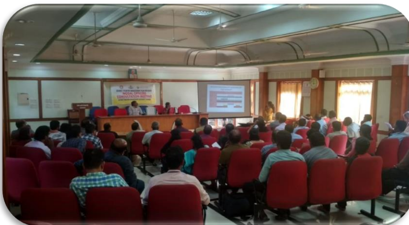
Figure 13 Ms Abija Jagadeesh during her session

District level civil society consultation meeting was organised at collecterate conference hall on