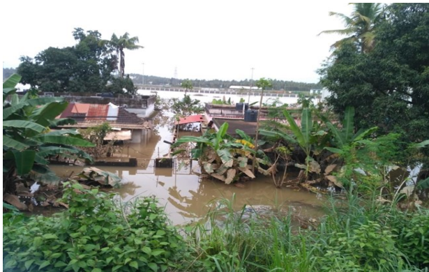
Fig B: Flooded homes in Kuttanad Region-Kerala

The 2018 Kerala Floods (Fig.B) were the worst in the region since 1924. Between August 7th and 20th, 504 people died and 23 million were directly affected by these flash floods. Economic losses accounted for 2.85 billion US$, the third costliest flood in India. This disaster also damaged or destroyed 110,000 houses, and deeply affected people's livelihoods, with more than 60,000 ha of culture damaged and many animals killed. Finally, these floods damaged more than 130 bridges and 83,000 km of roads, causing the isolation of certain communities.